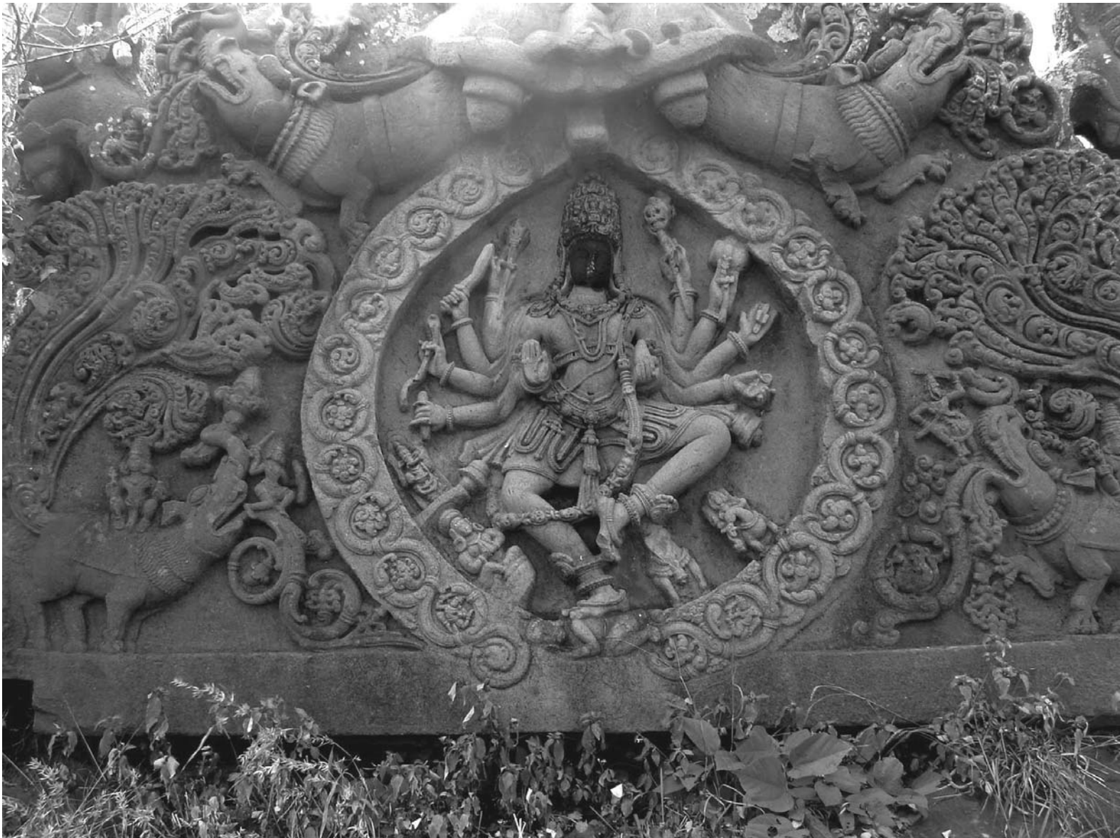
Kalgudi Stone Temple, Degulahalli, Karnataka